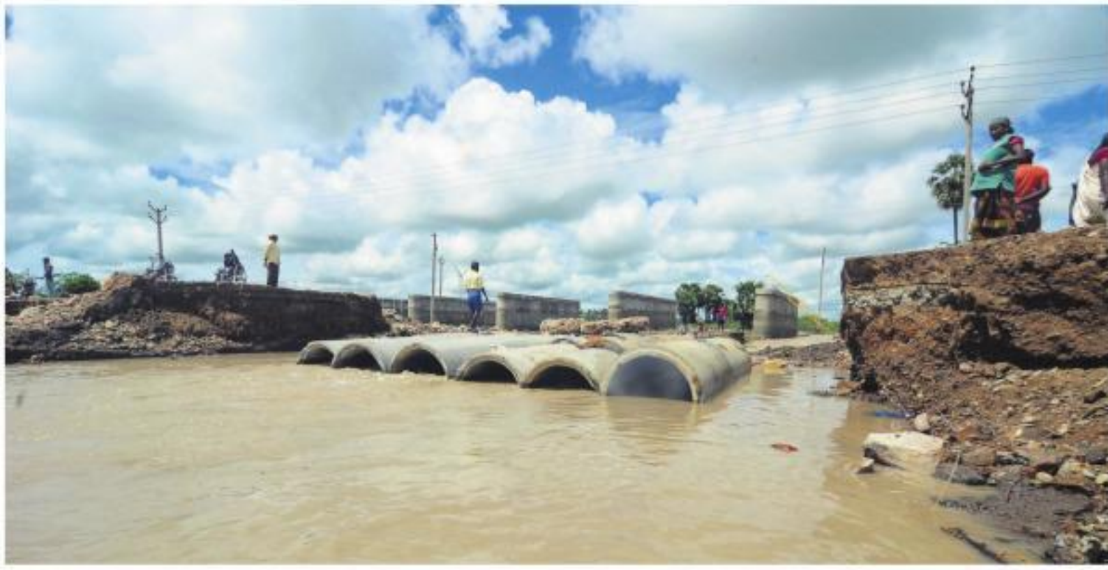
Chittar River Bridge washed away due to heavy rain on Wednesday night at Sekkarakudi in Thoothukudi