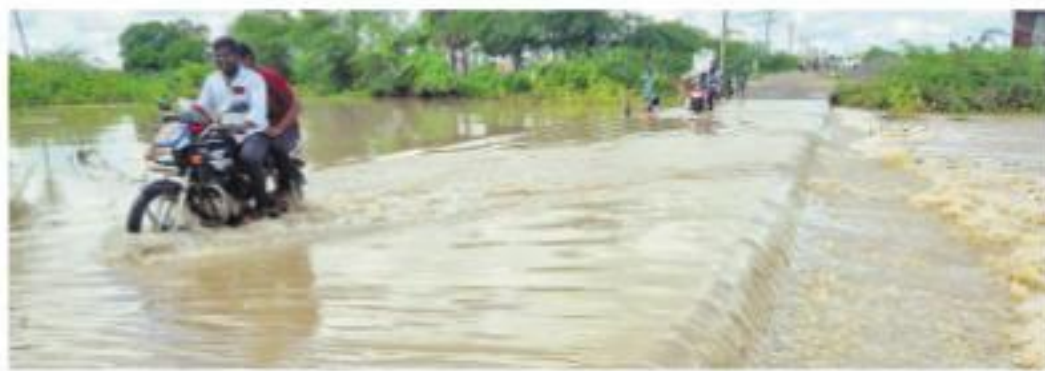
Commuters travelling on the bridge road at Sekkarakudi to Thalavaipuram in Thoothukudi inundated by rainwater

A ground-level bridge at Chekkarakudi village was washed away in flash floods following heavy downpour in Thoothukudi district on Wednesday late night. The district received 38.90 mm of rainfall throughout, with Ottapidaram reporting heavy rainfall of eight cm.