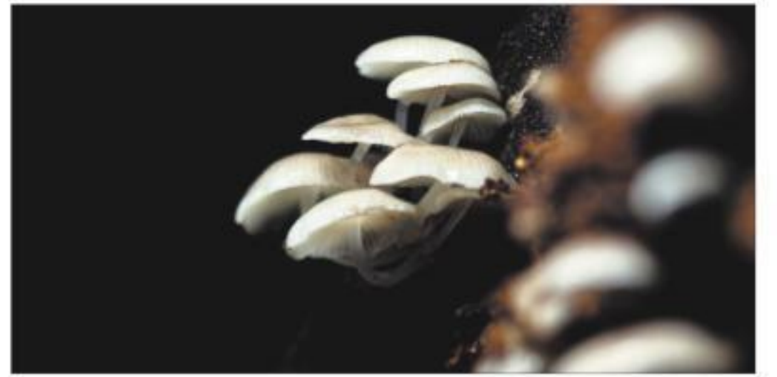
Rare bioluminescent mushrooms in Kanyakumari Wild Life Sanctuary | EXPRESS